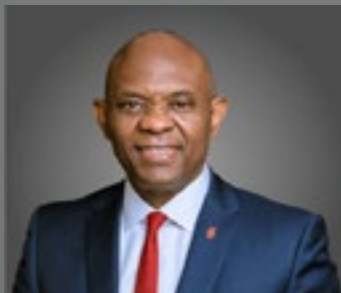
Mr. Tony Elumelu UBA Chairman