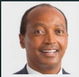
Dr. Patrice Motsepe African Rainbow Minerals CAF President South Africa Keynote Speaker