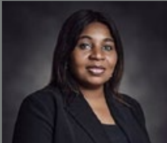
Her Excellency, Francisca Tatchouop Belobe

African Union Commissioner for Economic Development, Trade, Tourism, Industry and Minerals (ETIM)