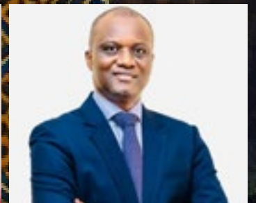
Abdourahmane Sarr Honorable Minister of Economy Planning and Corporation, Senegal