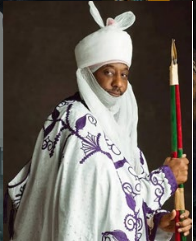
His Royal Highness Muhammad Sanusi II The Emir of Kano Royal Father of the Day