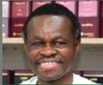
Dr. P.L.O. Lumumba Director, Kenya School of Law