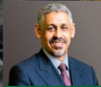
Dr Sidi Ould Tah President of African Development Bank Mauritania