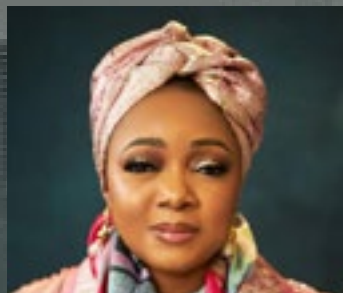
Hajiya Imaan Sulaiman Ibrahim Honorable Minister of Woman Affairs