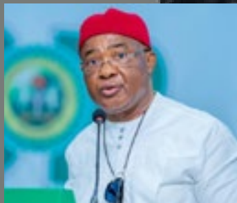
His Excellence Sen. Hope Uzodimma Executive Governor, Imo State