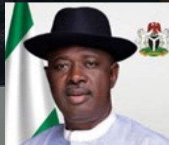
Heineken Lokpobiri, Minister of State for Petroleum Resources (Oil) Guest Minister- Nigeria