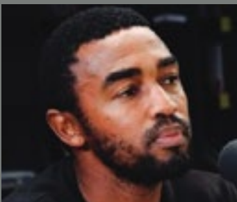
Mr Penuel Mlotshwa The Black Pen, South African Podcaster