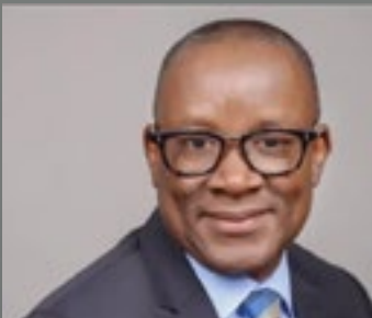
Sen. John Enoh Honorable Minister of Trade, Industry and Investment