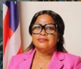
Hon. Magdalene Dagoseh Minister of Commerce & Industry- Liberia