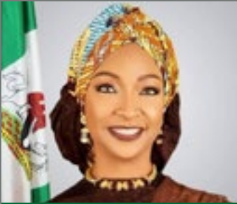
Hannatu Musa Musawa Honourable Minister of Art, Culture and the Creative Economy