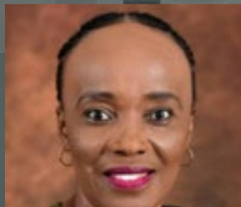
Sindisiwe Chikunga Minister of Women, Youth and People with disabilities South Africa