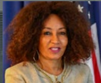
Lindiwe Sisulu Former South African Minister