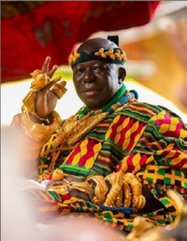
His Royal Majesty Otumfuo Osei Tutu II, Asantehene

The Symposium brings together decision-makers and changemakers capable of translating dialogue into action across Africa and the diaspora, including: